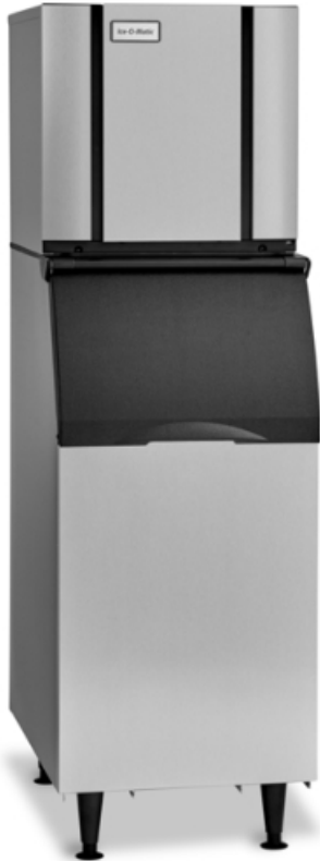
CIM0325 ON B42